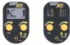
XT Model with LED and 9V battery light & programmable mode XT Model with LED and 9V battery

...and best of all, it's a SCHONSTEDT rugged, reliable and a 7-year warranty