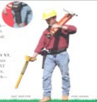
STEEL PIPE VALVE BOX CANT IRON PIPE STEEL BEARING

Time to make a move—to the new Schonstedt XT, the greatest innovation in magnetic locating since the celebrated "yellow stick". In its holster, the XT leaves both hands free on the way to the job site, then gives you the freedom to do your best work—with one hand tied behind your back.